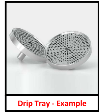
Drip Tray - Example