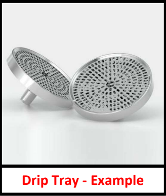
Drip Tray - Example